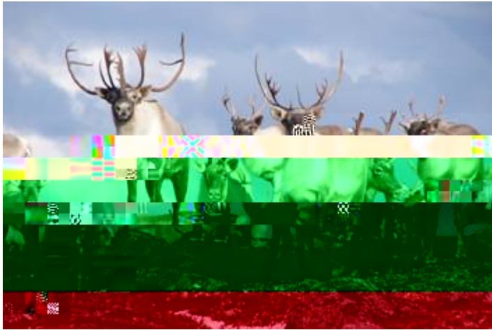
George River Caribou, Kamestastin, Labrador

Throughout this landscape, Ramah chert and quartz flakes can be found scattered or in concentrations along the maze of caribou trails, along with old camp sites. The field work operated out of traditional Innu camps and cabins, and included Innu families assisting in site interpretation.