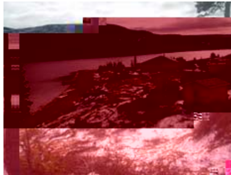
Tshikapisk Foundation camp, Kamestastin

Fieldwork in Archaeology was being offered as part of the ongoing Innu Environmental Guardians Program to support Guardians in the protection and care of their ancestral lands, Nitassinan, in preparation for self governance. Core to the program is that it is based within Innu cultural practices, values, and land use traditions, and that elders (tshishennuat) are integral to the teaching and evaluation of each module. For this reason, we chose Kamestastin as the classroom to explore the development and meaning of Innu archaeology. The module was planned to be concurrent with the migration of the large (up to 800,000) George River Caribou herd through the area, a time that Innu families from time immemorial have traveled to this area to camp and hunt.