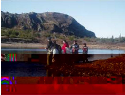
Fishing along the Kamestastin River